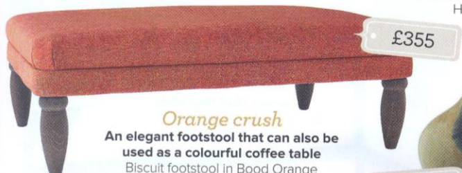
Orange crush An elegant footstool that can also be used as a colourful coffee table Biscuit footstool in Bood Orange textured cotton, Loaf