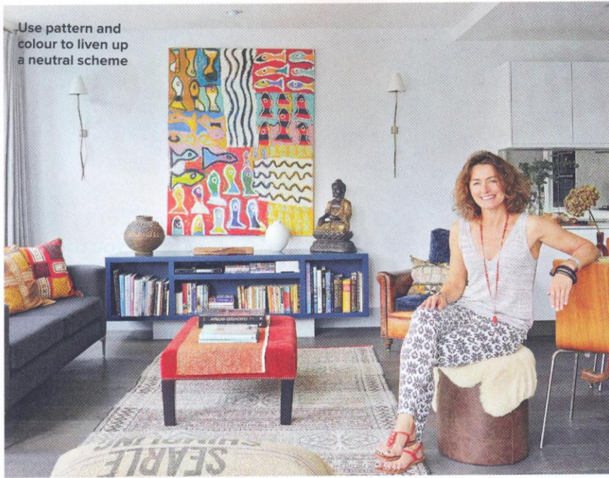
Use pattern and colour to liven up a neutral scheme