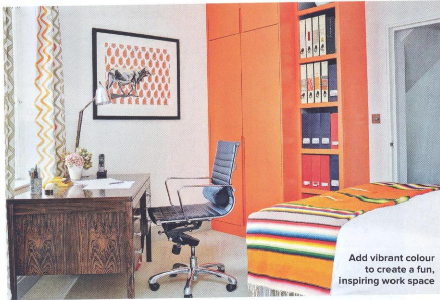
Add vibrant colour to create a fun, inspiring work space

FEATURE LISA FAZZANI